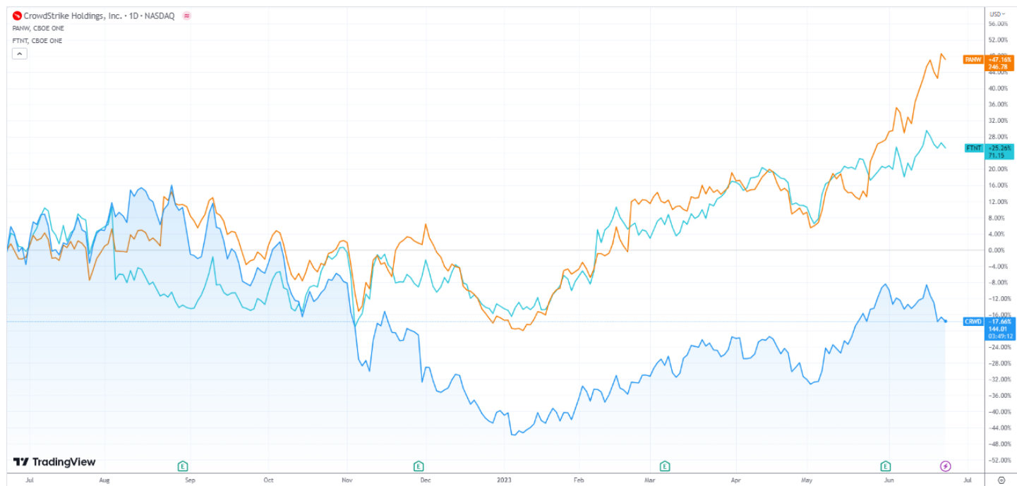
CRWD (blue line), PANW (orange), FTNT (teal) -- Source: TradingView

For this reason, we have recently been taking a closer look at CrowdStrike Holdings, Inc. (CRWD) , another cybersecurity leader we have watched closely over the years. As we examine the 1-year charts of these three businesses, clearly CRWD has lagged its peers: