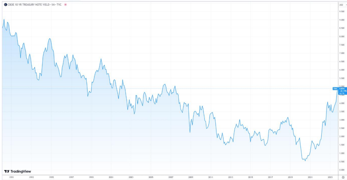
US 10-Year Treasury Rates since 1990 -- Source: TradingView

However, for investors with cash to put to work, there is a historical opportunity take advantage of the situation. Take a look at the chart of the US 10-Year Treasury rate since 1990. As you can see, we haven't seen 10-Year Treasury notes with this high of a rate since the era of 2007-2008: